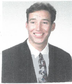
In Loving Memory of